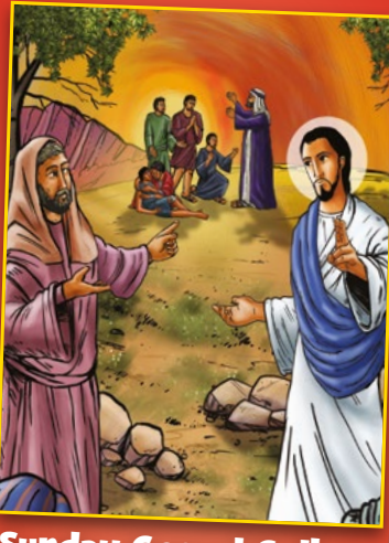
Sunday Gospel Gallery

Which word or words stood out for you in this Sunday's Gospel, and why? Spend a few relaxing moments pondering the picture together. Share any thoughts before moving on.